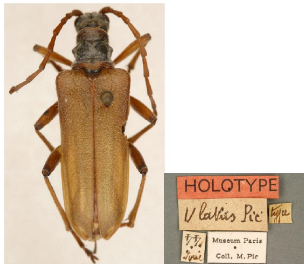
Fig. 2. Holotype of Toxotus insitivus var. latus Pic.

Toxotus? insitivus v. latus . — Big and large; all body covered with yellow or ash colored on the testaceous or reddish ground, with black prothorax and head. Antennae and legs yellow or red testaceous, less the knees which are more or less black. Prothorax rather long and narrow, with a short lateral projection and deep grooves (median and posterior). Elytra broad in shoulders, hard impressed, then rather narrowed to the apex which is oblique truncate, covered with thick, semi-recumbent hairs. Antennae robust, 1 st , 3 rd , 5 th segments less long than 4 th . —♂, ♀. Long. 14-17 mm. Width of shoulders 0-8 mm.